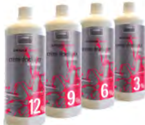
Infiniti Developer 6% & 9%