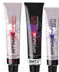
Infiniti Permanent 4.65 & 12.0s Intense Reds Red Violet Infiniti Intensives .1 Infiniti Satin .000 & 4.0