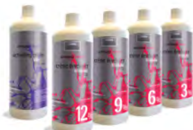
Infiniti Developer 3% & 9% & Satin Activating Crème