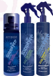
Sapphire Ice Defender, Glazer & Enforcer