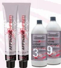
Infiniti Permanent 4.221, Intense Reds Magenta Infiniti Developer 3% & 9%